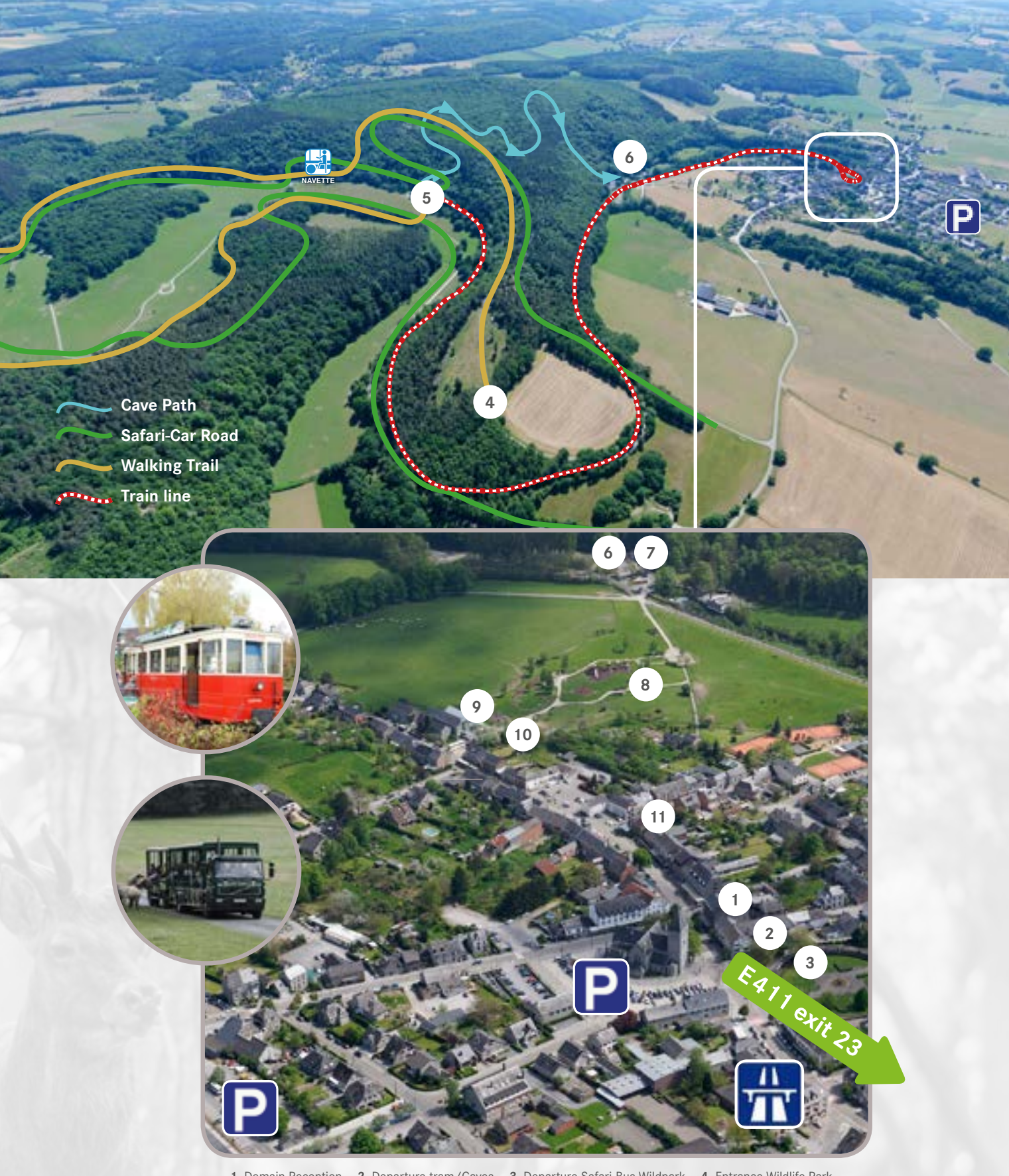
1. Domain Reception • 2. Departure tram/Caves • 3. Departure Safari-Bus Wildpark • 4. Entrance Wildlife Park 5. Entrance Caves • 6. Exit of the Caves • 7. Le Pavillon • 8. Playground • 9. La Verrière • 10. PrehistoHan • 11. Han 1900