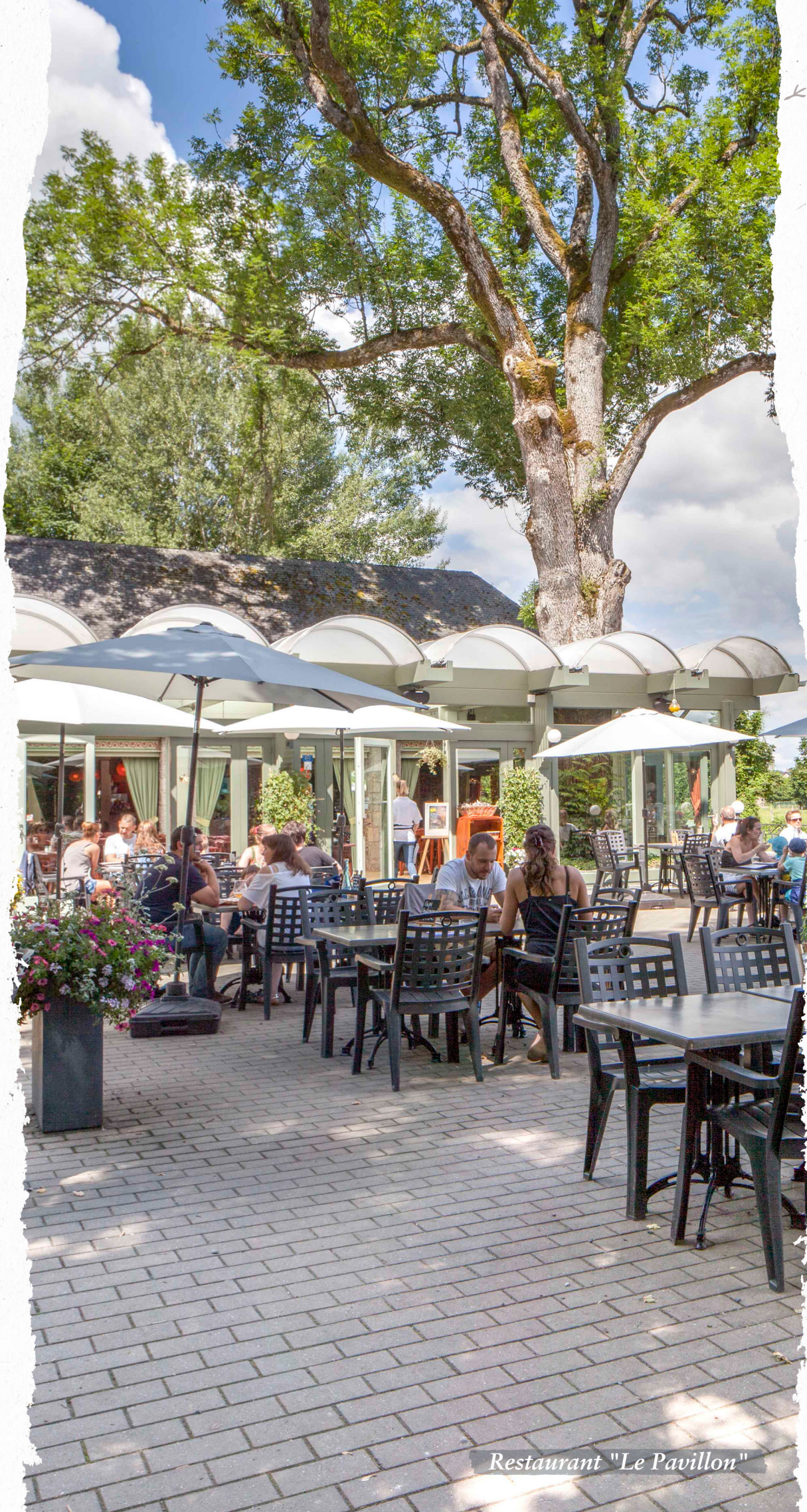
Restaurant "Le Pavillon"

Chicken nuggets, French fries, apple compote + 1 ice cream + 1 beverage